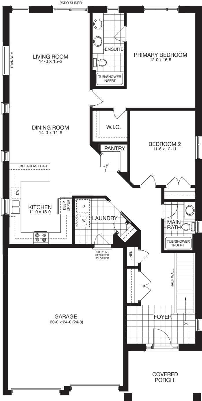
MAIN FLOOR Upgrade Plan: Kitchen